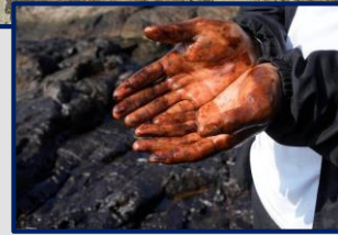
(Peru beach NY Times 21 st Jan)