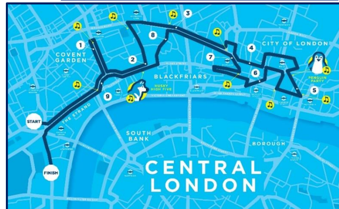
(London Winter Run 2022)

Details: https://www.londonwinterrun.co.uk/