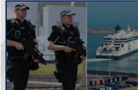
Headline 3 – Counter Terror police deployed on Ferries (Daily Mail 31 st January 2022)