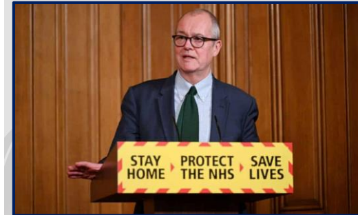
Headline 2.