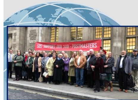
Headline 3 – Sub-postmasters Inquiry begins (BBC News 2022)

The Horizon Post Office scandal public Inquiry began this week overseeing an investigation into what has been described as the most widespread miscarriage of justice in UK history . Approximately 700 sub-postmasters and mistresses were wrongly convicted of theft because of financial shortfalls in their accounting between 2000 and 2014. The discrepancies are now believed to have been caused by a computer error in the system purchased from Japanese communication technology firm Fujitsu. A number of the convictions led to imprisonment , the longest sentence of which was three years and four months. Post masters not imprisoned made up the financial shortfalls at their own expense whilst many of the victims lost the trust of their community, suffered severe mental health issues, relationship breakdowns and livelihoods and homes lost. The Inquiry is expected to run all year. 2