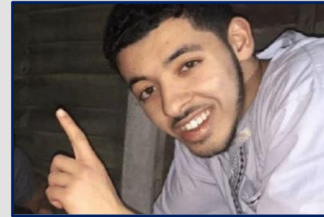
Headline 1 – MI5 had intell on Abedi prior to attack Manchester Evening News Dec 2020