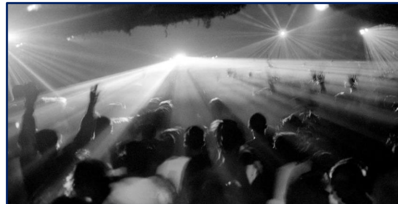
Insulate Britain