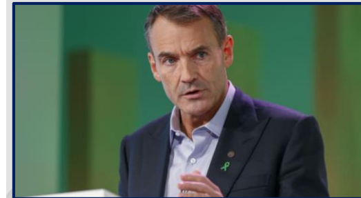
Headline 2 BP CEO Bernard Looney (CNBC 2022)