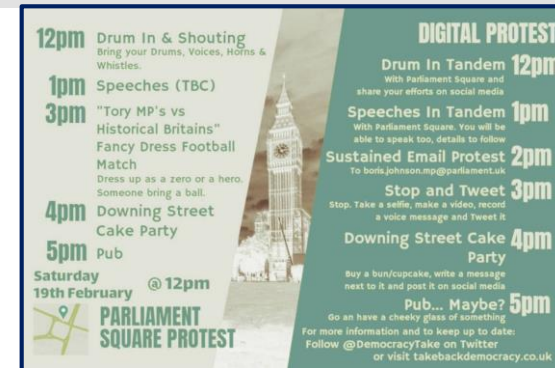
Take back Democracy (Twitter 2022)

Details: https://www.nus-scotland.org.uk/