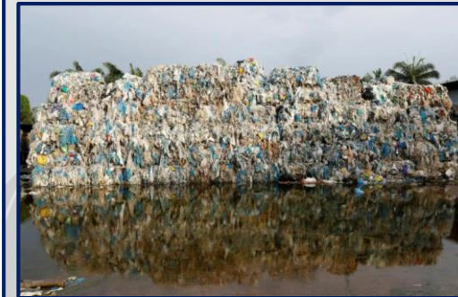
Headline 3 Plastics in Malaysia