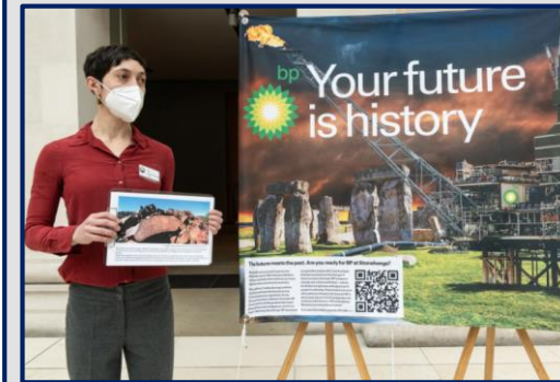
Headline 2. Stonehenge Exhibit Protest (The Art Newspaper 2022)

In January 2020 Malaysia returned 42 containers of illegal waste and Indonesia, Vietnam, Romania, Croatia, Poland and Belgium have all made requests to return waste to the UK also. 19.