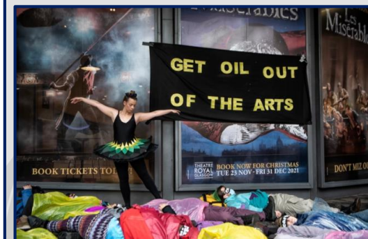
Headline 3 - NPG Protest (BPORNOTBP 2022)