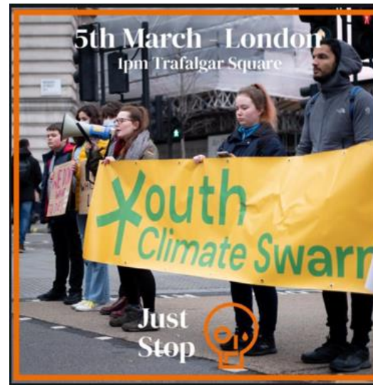
(Just Stop Oil 2022)

Location: Parliament Square, London Cause: Vigil for NABB during vote in House of Lords. Details: https://t.me/joinchat/40SbMWFwfl8yMTg0