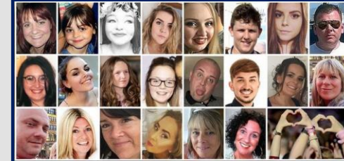
Headline 1 –MEN Arena Bombing Victims (Manchester Evening News 2022)

"I was pleased to see the huge amount of work that has been done in the last five years, not only by the police and the emergency services, but also by local councils and many other agencies, to improve our readiness to deal with terrorism. But we must not be complacent, the terrorist threat remains a real and present danger and we can never make London entirely safe."