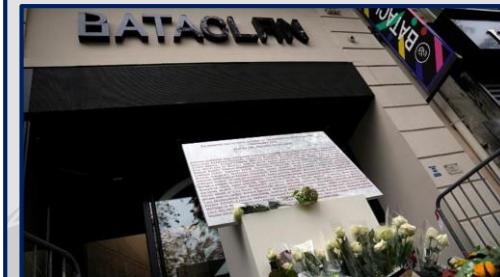
Headline 2 –Image of memorial outside Bataclan (Euronews 2022)