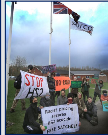
Bluebell Woods Protection camp (FACEBOOK 2022)