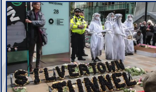
Headline 3. Silvertown Tunnel Protest (Guardian 2022)