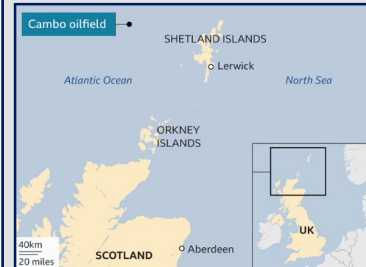
Headline 1. Map of Cambo Oil Field Location (BBC News 2022)

Greenwich has become the fourth London borough to oppose the Silvertown tunnel development joining Newham, Lewisham and Hackney. Greenwich's decision is significant as both boroughs primarily served by the tunnel (Greenwich and Newham) now oppose its completion with many activist groups calling for the project to be paused or shelved altogether.