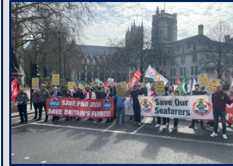
Headline 3. P&O protest outside Houses of Parliament (Evening Standard March 2022)

As the debate took place, hundreds of protestors gathered outside to demonstrate against the shock sacking of its British employees last week. Protestors marched from P&O's London HQ to Parliament where MPs such as Deputy Labour leader Angela Rayner and union representatives addressed the protestors. Due to concerns raised about the wages paid to replacement staff (believed to be £1.81/hour) and their ability to crew the ship, the UK Government announced P&O Ferries will not be allowed to sail from UK ports without first passing safety checks. On Tuesday it was announced the UK Government had given P&O until the end of the day to explain reasons behind the mass-firing before the government considered further action, this resulted in P&O offering GBP 36Million in compensation. Transport Secretary Grant Schapps suggested this may take the form of criminal proceedings and unlimited fines.