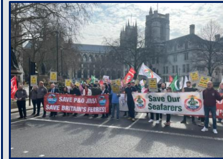
Headline 3. P&O protest outside Houses of Parliament (Evening Standard March 2022)

As the debate took place, hundreds of protestors gathered outside to demonstrate against the shock sacking of its British employees last week. Protestors marched from P&O's London HQ to Parliament where MPs such as Deputy Labour leader Angela Rayner and union representatives addressed the protestors. Due to concerns raised about the wages paid to replacement staff (believed to be £1.81/hour) and their ability to crew the ship, the UK Government announced P&O Ferries will not be allowed to sail from UK ports without first passing safety checks. On Tuesday it was announced the UK Government had given P&O until the end of the day to explain reasons behind the mass-firing before the government considered further action, this resulted in P&O offering GBP 36Million in compensation. Transport Secretary Grant Schapps suggested this may take the form of criminal proceedings and unlimited fines.