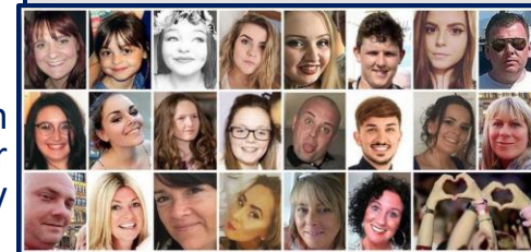
Headline 3 –MEN Arena Bombing Victims (Manchester Evening News 2022)