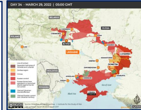
Headline 1: Russian Occupation of Ukraine (Al-Jazeera 29th March)