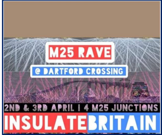
(Insulate Britain 2022)