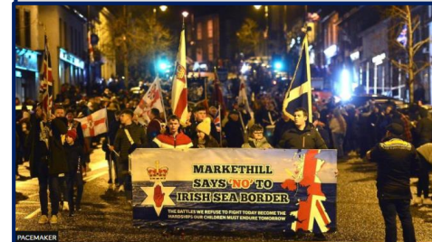
Headline 3: NI Protocol protestors (BBC News 29th March)