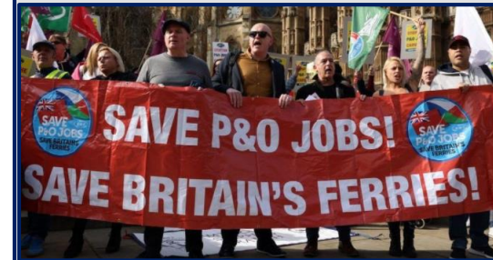
Headline 1. P&O protestors (BBC News March 2022)

The aquatic centre at the Queen Elizabeth Olympic Park remains closed this week after a chlorine gas leak last week left patrons struggling to breathe and resulted in 200 people being evacuated with 50 taken to hospital. The chemical incident is believed to have been triggered by a high quantity of Chlorine gas released after staff took delivery of pool chemicals forcing a mass evacuation. Patrons were treated at hospitals across the capital for breathing difficulties with two requiring an over-night for observation. The Olympic Park has reopened but with an investigation underway the aquatic centre remains shut.