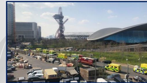
Headline 3 - Queen Elizabeth Olympic Park (Evening Standard March 2022)