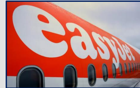
Headline 1. Easy Jet (Independent 2022)

Extinction Rebellion (XR) fringe group 'Just Stop Oil' has been out in force since Friday blocking access to a number of oil facilities across England leading to complaints of fuel shortages. Oil terminals in Southampton, Tamworth, Essex, Purfleet, Hemel Hempstead, Birmingham and Staines have all seen disruption involving blocked access to entrances, climbing of oil trucks and a tunnel system constructed under refineries in Grays, Essex. Over 200 arrests have been made and reports are coming in of fuel shortages across the Southeast of England. The campaign is expected to increase in momentum as this Saturday (9 th ) sees the launch of XR's Spring Action both Insulate Britain and Just Stop Oil have expressed their intent to join forces and create a month of disruption across the capital.