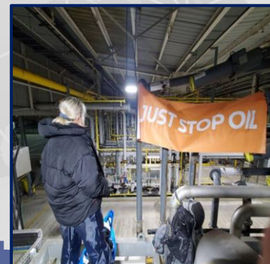
Just Stop Oil (TWITTER 2022)