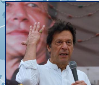
Headline 3: Imran Khan