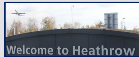
Headline 2. Heathrow Airport (Independent 2022)