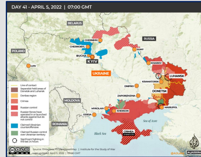
Headline 1: Map of Ukraine highlighting Russian controlled areas (AlJazeera 2022)

Pakistan Prime Minister Imran Khan has avoided a vote of no confidence after what some Pakistani politicians have described as an unconstitutional move whereby, he dissolved parliament, resulting in the vote being dismissed. New elections will be held in 90 days despite opposing parties questioning the move and launching an appeal in the supreme court, where deliberations continued on Tuesday. In protest, opposition parties held a sit-in at parliament together with a mock vote where 196 members voted against Khan. Had a no confidence vote gone ahead the opposition needed 172 votes to remove Khan's government.