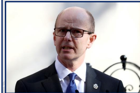
Headline 2 – Jeremy Fleming ( Reuters 2022 )