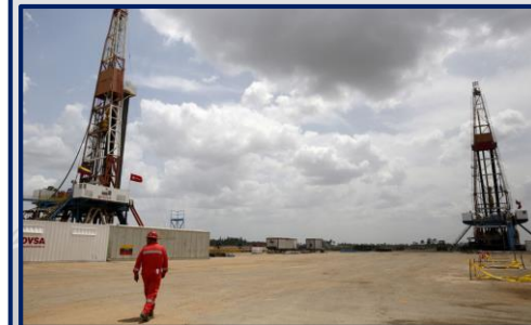
Headline 2. PDVSA Venezuela Site