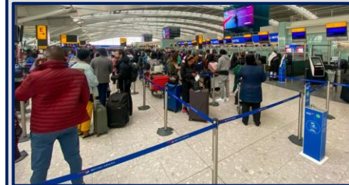
Headline 1. Heathrow Airport Queues (My London 2022)

Investment bank giant Credit Suisse has suggested that Venezuela (disputably home to the world's largest oil reserve) has the oil capacity to provide the US with an alternative to their partial reliance on Russian oil , increasing their forecasted country's economic growth from 4.5% to 20% and their GDP from 3% to 8%. The shock Credit Suisse announcement came after a high-level meeting in March between the Venezuelan government and the US where they discussed the easing of sanctions to accommodate such a move. The US currently imports 700,000 barrels of Russian oil a day and Credit Suisse suggests the South American neighbour can match that capacity. Questions remain however over Venezuela's beleaguered oil company's (Petroleos de Venezuela, PDVSA) ability to facilitate this in light of poor management and key infrastructure needing immediate replacement or upgrading.