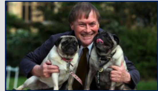
Headline 1 – David Amess (GB NEWS 2022)

"The killing of Palestinian and Israeli civilians only leads to a further deterioration of the situation".