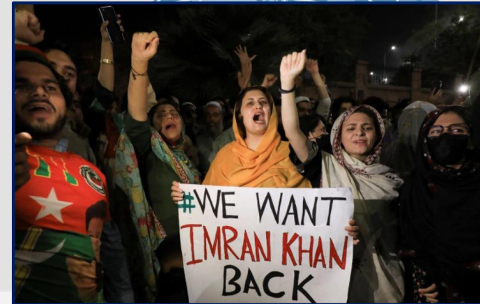
Headline 3: Imran Khan supporters (Aljazeera 2022)