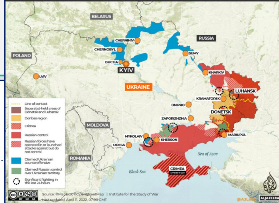
Headline 1: Map of Ukraine highlighting Russian controlled areas (AlJazeera 2022)