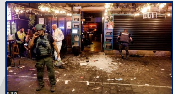
Headline 3 – Dizengoff Street bar attack (BBC 2022)