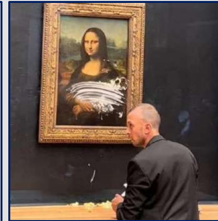
Headline 1: Mona Lisa Attacked with Cream (Planet News Post 2022)

Shell and BP spoke out against UK Chancellor Rishi Sunak's divisive windfall tax last week with both stating it was a threat to future investment in North Sea oil and gas. The 'tax' (essentially an extra 25% tax on energy firms) is being introduced to help raise GBP 5Billion in funds to support the cost of the living crisis and high energy costs, but is criticised for not being a one-off and will stay in place until the end of the crisis or December 2025. Despite being given 91 pence in the pound tax breaks on UK energy supplies to combat the new levy BP and Shell state its not enough adding the potential longevity is worrying and doesn't take into account renewable energy.