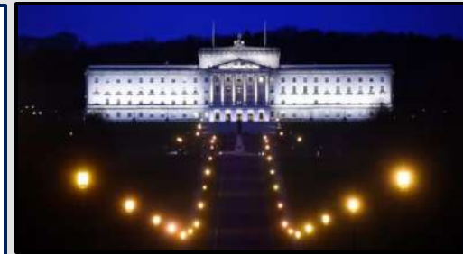
Headline 1: Stormont, Northern Ireland - (FT 2022)

Thousands of pro-Israel protestors marched through Jerusalem's 'Old City' at the weekend in celebration of the yearly anniversary of the 1967 capture of East Jerusalem. Israeli Jews protested through the streets and stormed the Al-Aqsa mosque with Israeli security forces outnumbered and powerless to stop them. Palestinians responded with counter protests in the West Bank and the burning of Israeli flags leading to confrontations, arrests and injuries. Hamas had warned protestors not to storm the mosque saying it would 'use all means to confront them'. Last years tensions resulted in an eleven day war in the region.