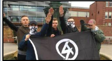
Headline2: National Action – (BBC NEWS 2022)

During the pandemic police saw the number of arrests for terror offences drop in all age groups with the exception of under 18s. Arrests rose from 5% in the year to March 2020 to 13% in the year to March 2021.