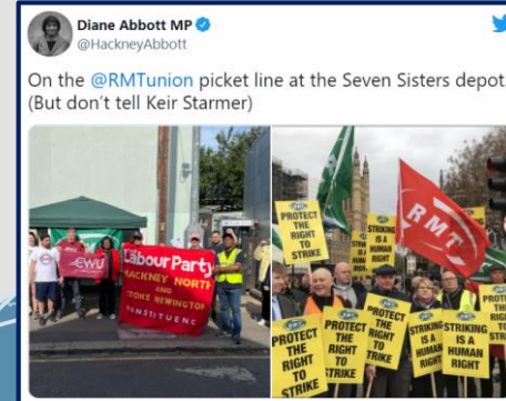
Headline 2: Picket Line Twitter 2022