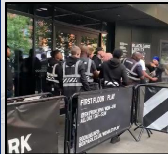
Headline 3: BOXPARK WEMBLEY Twitter 2022