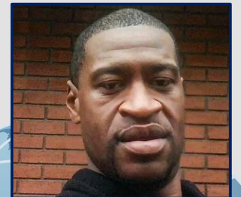
Headline 2: George Floyd (Dailymail 2022)