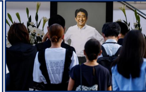
Headline 1: Japanese Former Prime Minister, Shinzo Abe

"...It's important to also pay tribute to the heroes who came to London's aid that day. From emergency service workers and staff on our transport network, to the extraordinary members of the public who ran towards danger without hesitation to save lives and help those in need. Our city is in their debt...London will always stand united against the evils of hatred and terrorism and our values of freedom and mutual respect will always prevail over those who seek to divide us."