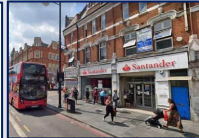
Headline 1: Santander Branch, Brixton ( MyLondonNews 2022 )

Knights Security and Wimbledon officials have refused to comment on the incident. The three men are due to appear in court later this month.