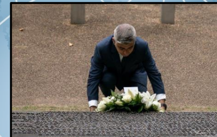
Headline 3: Sadiq Khan at 7/7 Memorial (BBC NEWS 2022)