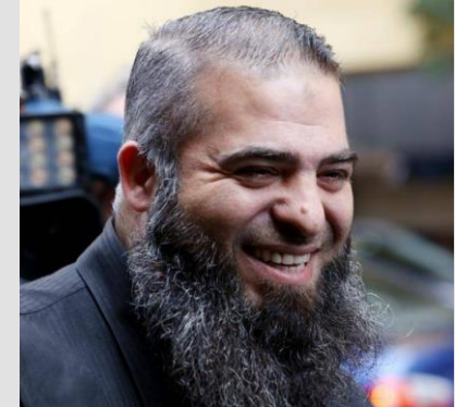
Headline 2: Self-proclaimed Emir of the Shura Hamdi Alqudsi ( NorthWest Star 2022 )

"MI5 must be given additional funding to enable it to conduct these cases without other areas of work suffering as a consequence."