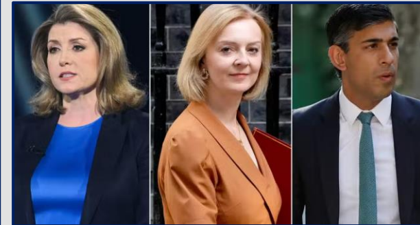
Headline 1: Leadership Contenders (Independent 2022)

Acting Sri Lankan President Ranil Wickremesinghe refreshed the government's state of emergency at the weekend after the departure of President Gotabaya Rajapaksa who fled (to Singapore) amidst rising tensions over the economic crisis impacting the country. The caretaker President ratified the existing state of emergency arming the police and military ahead of this week's election. Sri Lanka declared itself bankrupt after running out of money in April for the import of many goods from medicines to food and fuel leading to civil unrest and protests including a 100 day occupation of the presidents office and the storming of the official residence. Sri Lankans take to the polls on Wednesday 20 th July to elect a new President.