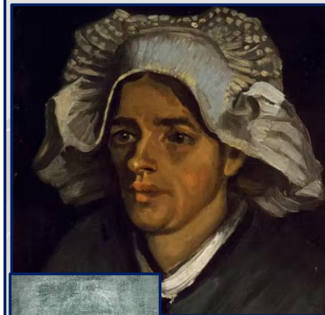
Headline 3: Front and Back of Van Gogh Painting (Independent 2022)