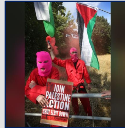
Pal Action Outside Shenstone (Twitter 2022)

Subscribe today to receive bespoke threat intelligence during the XR Campaign. advisoryservices@wilsonjames.co.uk