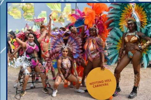
Headline 2: Notting hill Carnival Dancers (My London 2022)