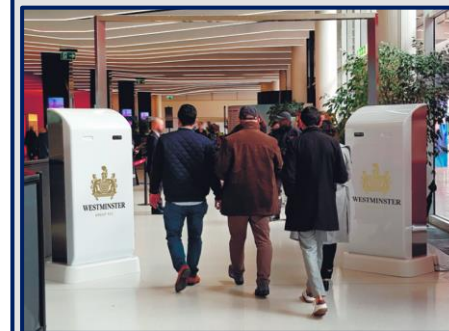
Headline 1: Westminster Group's MassScan

"The private security industry faces unprecedented demand for highly-trained, licensed security officers from organisations and events who recognise they need to purchase security services based on risk and professionalism rather than cost. Security is more than a high-visibility vest and buyers are more willing to invest in quality now to achieve a safer, more secure environment...As a sector we are moving quickly to attract more security officers into the industry, letting people know security can be a career of choice for team players who care about providing a professional service to protect people, property and places and who will commit to the training. Failure to achieve this could compromise public safety and some big events may not be able to happen as planned."