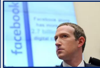
Headline 1: Mark Zuckerberg (Independent 2022)

"The main aim of exercises like this is to increase public safety in the night-time economy by working with venues and security staff. It's also to showcase best practice by putting the Action Counters Terrorism (ACT) security e-learning package, which we've been recommending to all SIA-licensed operatives, into practice. We're really pleased with the commitment that all the security staff put into the exercise at the Steel Yard."