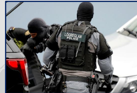
Headline 3: The Special Forces in the Capital Region of Iceland