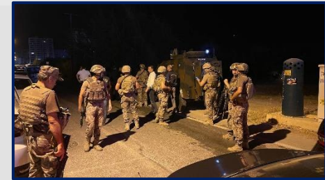
Headline 1: Security Forces seen near the site in Mersin 26 th September

Iceland has consistently topped the Global Peace Index since 2008 (when it was first included in its rankings) and attacks are incredibly rare, however, last Thursday (22 nd September) police arrested four suspects over alleged plans for a terror attack. The investigation remains ongoing and although motives are unclear, it has been reported the intended targets were 'various institutions' and 'citizens of the state', according to Karl Steinar Valsson, Iceland's National Police Commissioner. Semi automatic weapons, some 3D printed and a large quantity ammunition were seized from nine different locations. Police are currently investigating if there are links between the suspects and extremist organisations and are liaising with other foreign authorities for further information. Valasson commented that 'this is the first time such an investigation has been launched in Iceland'.