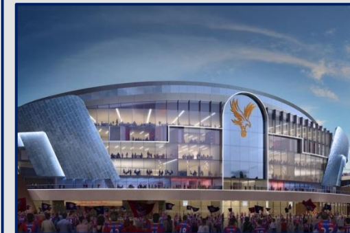
Headline 1: Crystal Palace Football Club

The 'Real Living Wage' (not to be confused with the 'National Living Wage') has risen to £11.95 in London (representing an 8% increase in wages for the 140,000 workers with committed employers) and a 10.1% increase elsewhere in the UK to £10.90 per hour. These new rates mean individuals on minimum wage will earn between £3k and £5k more a year depending on their employers level of commitment. It is important to note these rates are separate to the 'National Living wage' (NLW), currently £9.50 per hour. The real 'Living Wage' is the only wage rate independently calculated based on rising living costs. In London, a full-time worker on the new Real Living Wage rate could earn an additional £4,777.50 a year compared to a worker on the current NLW.