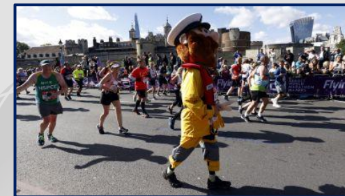
Headline 2: London Marathon