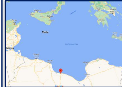
Headline 2: Sirte, Libya

The Taliban have reportedly attacked a group of female protestors demonstrating against Friday's bombing of an exam hall in the Kaaj educational centre in Dasht-e-Barchi, West Kabul, Afghanistan, that left 35 (mainly young girls and women) dead and 82 injured. The suicide bomb was denotated just before the start of an exam and although no one has so far claimed responsibility it bears a striking resemblance to two previous attacks on education centres in Kabul in recent years ( 2020, killing 24 and 2021 killing 85 ), one of whom was claimed by a local ISIS group. The Shia Hazara people are one of the largest ethnic groups in Afghanistan but face attacks and are regular targets for the Taliban or ISIS. About 50 women took to the streets to protest against the bombing chanting "stop Hazara genocide, it's not a crime to be a Shia" as the Taliban reportedly fired weapons above their heads, beat them and used pepper spray to disperse the crowd.