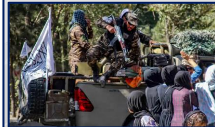
Headline 2: Taliban Attacking Protestors ( Guardian 2022 )