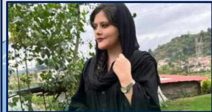
Headline 3: Mahsa Amini (BBC 2022)