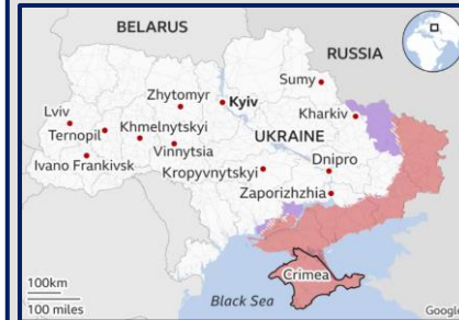
Headline 1 Cities Across Ukraine Reporting Air Strikes (BBC 2022)

Protests in support of the women of Iran have also taken place across the UK with thousands attending a rally in London in early October. An event at the Hammersmith Apollo was evacuated as a precaution at the weekend after receiving a bomb threat during a performance by Iranian singer Dariush Eghbali. No devices were found.