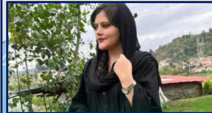
Headline 3: Mahsa Amini (BBC 2022)