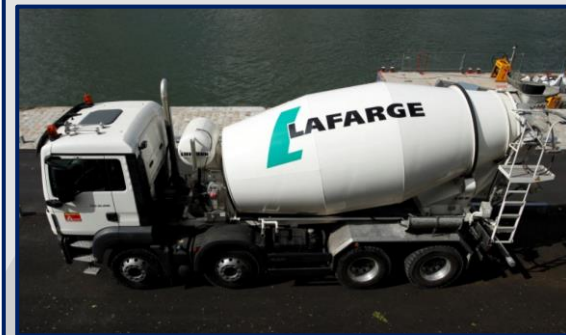
Headline 3 : Lafarge Cement Truck (Aljazeera 2022)