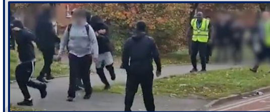
Headline 2: Hero Security Guards and Machete Style Knife Used ( The SUN 2022 )