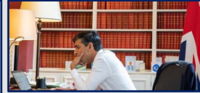
Headline 1: Rishi Sunak (Proactive Investors 2022))

"The Metaverse has the potential to transform every aspect of our daily lives with enormous implications for law enforcement...but in order for police to understand the Metaverse, we need to experience it."