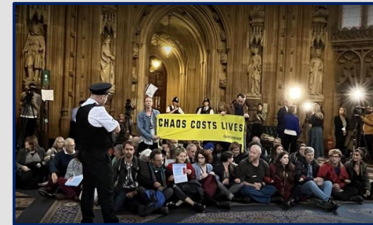
Headline 1: Greenpeace Activists at House of Commons ( Greenpeace 2022 )

"what the ministry has examined and what the concrete allegations against me look like".