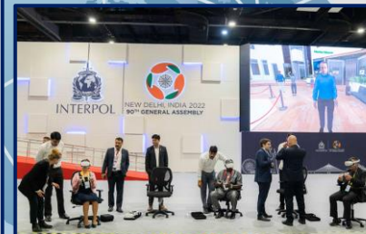
Headline 3 Attendees try out Interpol's Metaverse (INTERPOL 2022)