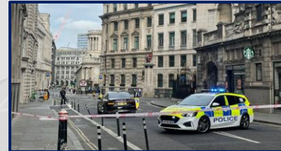
Headline 3: Cordons in the City ( MyLondonNews 2022 )