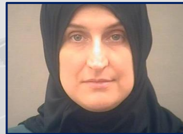
Headline 3: Empress of ISIS (Aljazeera 2022)