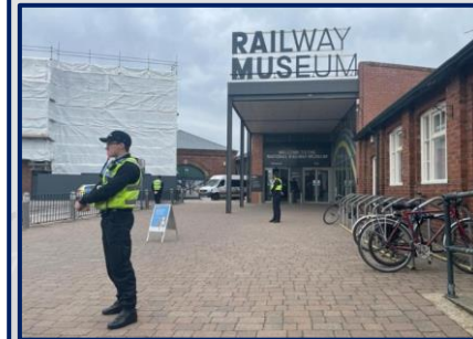
Headline 3: Project Servator Officer, National Railway Museum (York Press 2022)