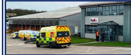
Headline 1: Rotherham Fed-Ex Site (DailyMail 2022)

North Yorkshire Police's Project Servator officers have been out in force across the county this month, making an appearance at Wilson James client, the National Railway Museum in York last week, encouraging members of the public to engage with their officers. Project Servator's nationwide operation concentrates on 'unpredictable and highly visible deployments' to disrupt a range of criminal activity and aims to engage with businesses, communities and the general public. Members of the public are encouraged to approach officers and say hello.