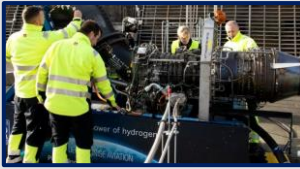
Headline 1: Hydrogen Engine (Rolls Royce 2022)

Rolls Royce and EasyJet have announced the first successful ground test of their hydrogen fuelled engine, marking a breakthrough in ‘green’ avionics. Rolls Royce supported by Easy Jet repurposed an old gas turbine engine with the aim of showing “it is possible to run and control a jet engine using hydrogen fuel, rather than conventional aviation fuels.” Their results showed an engine using hydrogen can start up and run at very low speed but the process could be lengthy requiring decades to transition.