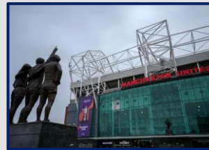
Headline 2: Manchester United (Independent 2022)