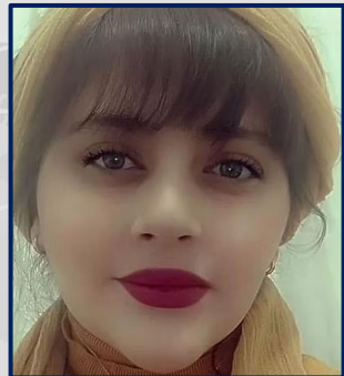
Headline 3: Mahsa Amini (Daily Mail 2022)