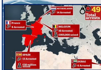
Headline 3: Location of Arrests Operation Desert Light DailyMail (2022)