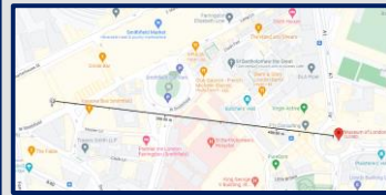
Headline 3: West Smithfields, The London Museum (Google Maps 2022)