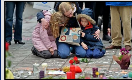
Headline 1: Mourners at Bomb Site EURONEWS 2022