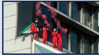
Headline 2: Elbit Protestors (Morning Star online 2022)

The Museum of London is to relocate from its London Wall location to West Smithfield, with a 24 hour closing ceremony this weekend involving events such as a DJ workshop, late night cinema and table football. The iconic museum has been at the Barbican for 45 years and plans to move to nearby West Smithfield market (due to its proximity to the Elizabeth line), opening in 2026. The move will see a change of name as well as location from Museum of London to The London Museum. The original building is to be demolished after it closes its doors for the final time this Sunday at 17:00.