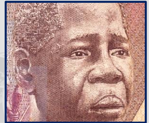
Headline 3: Zimbabwe anti-colonial Heroine Mbuya Nehanda ( Independent 2022 )