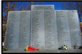
Headline 1: Lockerbie Memorial at Dryfesdale Cemetery (Pan Am 2022)

Umar Patek, who constructed the devices for the Bali bombings (Indonesia's worst terrorist attack) in 2002 where 202 people were killed (including 88 Australians), has been released from prison after serving only 12 years of a 20 year sentence. Indonesian officials claim Patek is a success story of their deradicalization programme and released him early for good behaviour. He was found guilty of constructing the Kuta bombs, weapons and conspiracy charges regarding an in-country terrorist training camp and for constructing the devices used in Christmas Eve church attacks in 2000. He was arrested in Abbottabad, Pakistan in 2011 and extradited to Indonesia. His release was delayed a few months due it unfortunately coinciding with the 20 year anniversary of the attacks. The Australian government and relatives of the victims have expressed horror at the news and objected to the timing of his release. Australian PM Prime Minister Anthony Albanese described Patek as "abhorrent".