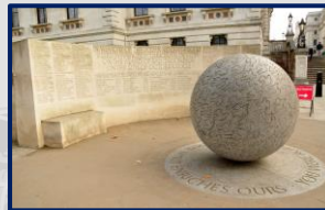
Headline 3: Bali Bombings, London Memorial