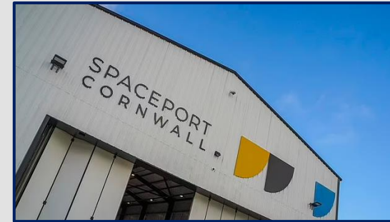
Headline 1: Spaceport Cornwall DailyMail (2022)

Newquay Airport, Cornwall will host the first ever space launch from the UK at it’s new Spaceport Cornwall , which will see Virgin’s ‘Cosmic Girl’ set off from the airport. The converted Boeing 747 will deploy its rocket (LauncherOne) mid-air before returning to land. The rocket will release a payload of ‘mini cube shaped satellites’ into low orbit allowing the Ministry of Defence to monitor the earth and oceans. Spaceport Cornwall is a horizontal launch site and will be joined by two vertical launch sites in the North of England and Scotland which are currently not yet operational. The launch will take place this week on Wednesday 14 th December just before midnight, Cosmic Girl will fly to an altitude of 35,000 feet before releasing its payload.