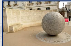
Headline 3: Bali Bombings, London Memorial