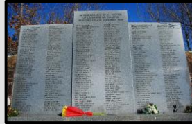
Headline 1: Lockerbie Memorial at Dryfesdale Cemetery (Pan Am 2022)

Umar Patek, who constructed the devices for the Bali bombings (Indonesia's worst terrorist attack) in 2002 where 202 people were killed (including 88 Australians), has been released from prison after serving only 12 years of a 20 year sentence. Indonesian officials claim Patek is a success story of their deradicalization programme and released him early for good behaviour. He was found guilty of constructing the Kuta bombs, weapons and conspiracy charges regarding an in-country terrorist training camp and for constructing the devices used in Christmas Eve church attacks in 2000. He was arrested in Abbottabad, Pakistan in 2011 and extradited to Indonesia. His release was delayed a few months due it unfortunately coinciding with the 20 year anniversary of the attacks. The Australian government and relatives of the victims have expressed horror at the news and objected to the timing of his release. Australian PM Prime Minister Anthony Albanese described Patek as "abhorrent".