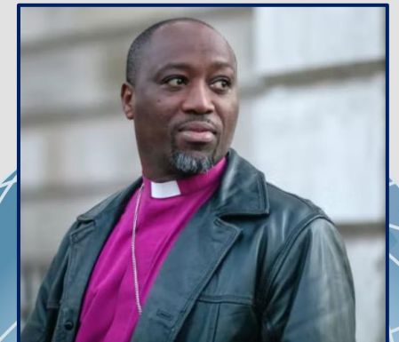
Headline 2: Bishop Climate Wiseman Independent (2022)