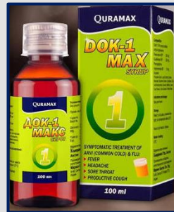
Headline 1: Contaminated Cough Syrup (BusinessToday 2022)

In October last year this digest highlighted the concerning alert issued by The World Health Organisation (WHO) regarding the deaths of 70 Gambian children linked to four contaminated cough syrups produced in India. Last week the WHO issued another alert, this time for Uzbekistan, where 19 children have now died from using Ambronol and DOK-1 Max syrups, produced by another Indian firm, Marion Biotech. Tests by the Uzbek Ministry of Health found the syrups again to be contaminated with "unacceptable amounts of diethylene glycol and /or ethylene glycol". Manufacturers have stopped the production of the syrups and the company's license has been suspended while investigations continue. India is known as 'the pharmacy of the world' due to its USD42 Billion dollar pharma industry (expected to grow to USD120 Billion by 2030), producing and exporting to over 200 countries and territories.