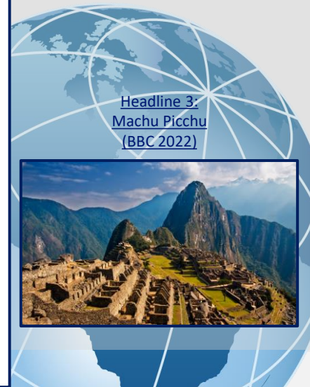
Headline 3: Machu Picchu (BBC 2022)