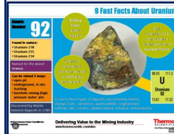
Headline 1: 9 Facts about Uranium (ThermoFisher 2013)