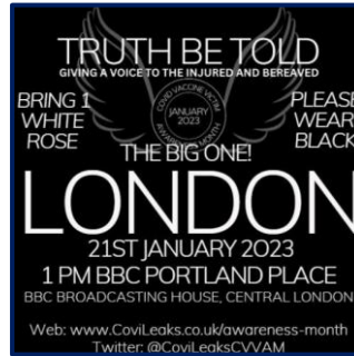
Truth be Told (2023)

Details: Boycott, Divestment, Sanction Movement