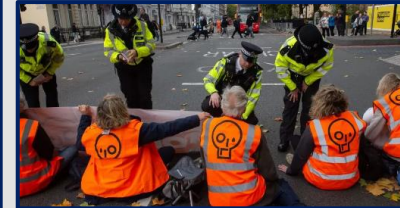
Headline 2: Just Stop Oil Protestors (BBC 2022)

The Peruvian Government has extended its state of emergency for another 30 days in its capital Lima and three other regions, as protests continue across the country against the ousting of former president Pedro Castillo in December on fraud charges. At least 42 people have died and hundreds injured in violent demonstrations that have crippled the country, as skirmishes break out in areas such as Cusco, prompting the temporary closure of Peru's greatest tourist attraction Machu Picchu, the rail link to the attraction and the city's airport. Peru's vice-president Dina Boluarte has taken over from Castillo making her Peru's sixth president in five years. Boluarte has apologised for the violence but has refused to acquiesce to calls for her to stand down. The Foreign Office has issued advice for British travellers to the country, please click here .