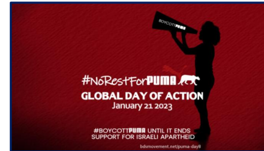
Boycott, Divestment, Sanction (2023)