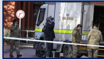
Headline 1: Bomb Disposal Experts outside St James' Hospital Leeds