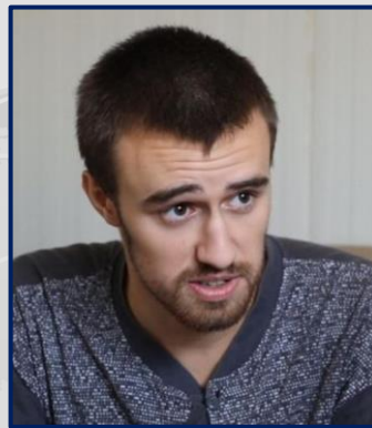
Headline 2: 'Jihadi Jack' (Sky News (2023))