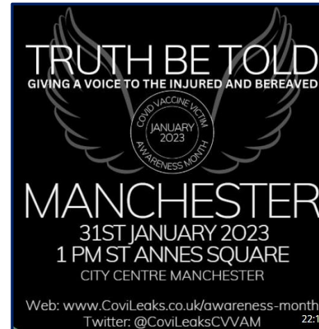
Nationwide Rallies UK (2023)