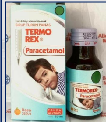
Headline 3: Contaminated Cough Syrup (BusinessToday 2022)