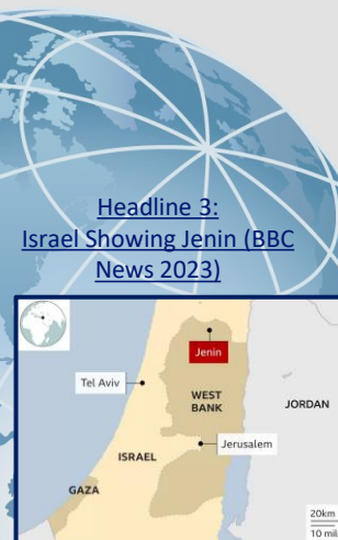
Headline 3: Israel Showing Jenin (BBC News 2023)