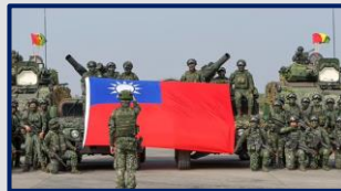
Headline 1: Taiwan Troops (Dailymail 2023)

Tensions mount in Israel as Israelis and Palestinians continue their tit for tat attacks that have left 32 Palestinians and nine Israelis dead so far this year. Israeli forces are retaliating after the deaths of nine people following two incidents over the weekend which started on Friday (Holocaust Remembrance Day). Commentators suggest the Palestinian attacks were in response to a deadly attack by Israeli forces in the occupied city of Jenin that killed nine last week. Israeli forces are suspected to have killed 220 Palestinians in 2022 (compared to 30 Israelis by Palestinians) as part of their operation "Break the Wave", which also sets out to displace family members of known Palestinian terrorists by destroying their homes and cancelling social security benefits. The second of the two Palestinian attacks is believed to have been carried out by a 13 year-old boy who was detained and is currently in hospital. The family home belonging to the suspect for the initial attack on Friday has already been destroyed.