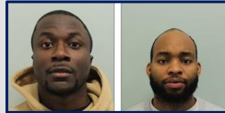
Headline 2: Heathrow Cannabis Smugglers NCA (2023)

The New HMP Fosse Way prison in Leicester (previously known as HMP Glen Parva) is encouraging business owners to offer training and employment to its inmates in a bid to improve the reintegration and rehabilitation of prisoners when they leave the facility. Security group SERCO together with the local council held an open day last week to encourage local businesses to support the offenders and 'break the circle of crime'. The prison is hoping to get interest from employers able to recruit for barista training, cycle maintenance, air conditioning and duct cleaning, waste management, kitchens and catering, construction, call centres, barbers, painting and decorating, and woodwork and carpentry.