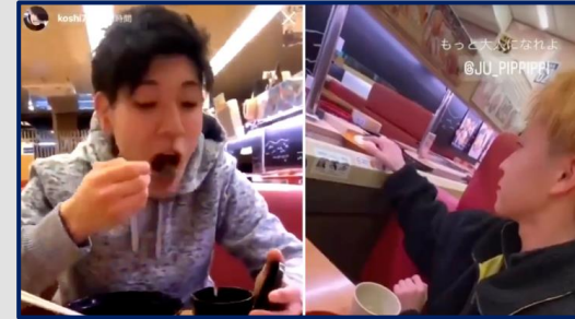
Headline 2: Saboteurs at Sushi Restaurant (New York Post 2023)

Iran's Interior Ministry confirmed the arrest of four men in relation to the schoolgirl poisonings from last year that affected over 91 schools and poisoned over 1,000 girls. Official reports from the country's Interior Ministry state the suspects were 'anti-regime activists with ties to "foreign-based" media' in an attempt to spread 'fear and horror' amongst Iranians. However other 'official' statements from elsewhere within the regime suggest otherwise with one official stating 'non-hostile individuals' were responsible and had been "offered guidance". The poisonings have sparked another wave of protests in the religiously restrictive country which prompted arrests last week and the regime is refusing to provide any details, or the total number arrested in relation to the poisoning offences. A spokesperson for the UN said they were continuing to monitor the situation calling for a "credible, independent investigation and accountability." They maintain if it's found the poisonings are related to the recent protests then it falls within the UN mandate to investigate.