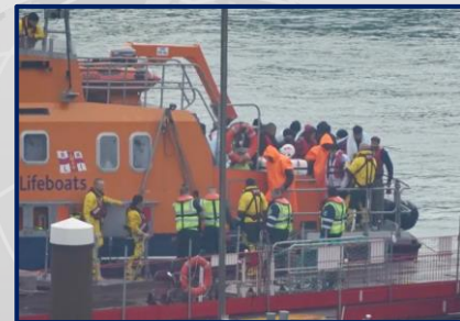
Headline 2: Illegal Migrants on RNLI Boat Arriving at Dover (Kent online 2023)