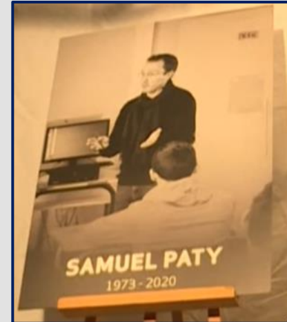
Headline 1: Samuel Paty Memorial (France 24 2023)

London's City Airport announced earlier this month they have become the second airport in the UK (together with Teesside Airport) to remove the 100ml volume limit on liquids allowed in hand luggage. The introduction of the new C3 security scanners also negates the need to remove electrical items and liquids from carry-on bags for inspection. For more information on the C3 scanners please click here , for more information on the amended security protocols for London City Airport including their new 2 litre hand luggage liquid limit please click here .