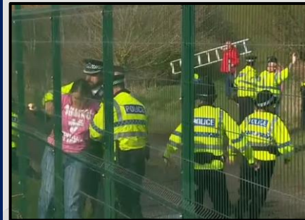
Headline 2: Animal Rising at Grand National (ITV 2023)