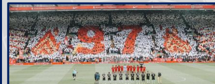
Headline 3: Hillsborough Tribute at the KOP (Liverpool FC 2023)