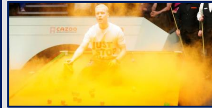
Headline 1: Just Stop Oil protestor at Crucible (Talksport 2023)

Saturday 15 th April saw the 34 th anniversary of the Hillsborough Football Disaster that killed 97 people and injured 766 others. The 1989 crush occurred at the Liverpool supporter's end of an FA Cup semi-final football match between Nottingham Forest and Liverpool at the Hillsborough stadium in Sheffield. Fans were initially blamed for what is still considered the 'worst sporting disaster in British history' and following years of campaigning were finally vindicated when the 2012 Hillsborough Independent Panel found the blame lay with the police and crowd control measures at the stadium which compromised safety. Liverpool were not in play on Saturday and so marked the occasion at their preceding weekend fixture and held a minute's silence at the club on the day. Local rivals Everton also held a minute's silence before their game against Fulham and as did racegoers visiting Aintree for the Grand National.