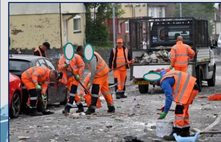
Headline 1: Riots and Aftermath (Wales Online 2023)