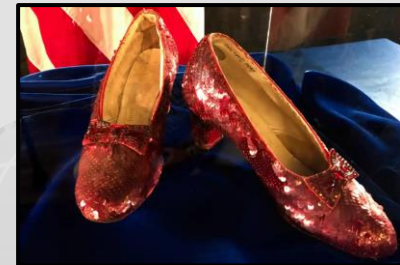
Headline: 3 Dorothy's Ruby Slippers (The Guardian 2023)