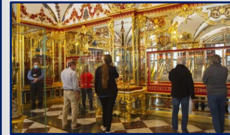
Headline: 2 The Jewell Room, Green Vault Museum, Germany

A court in Germany has convicted five men for their involvement in the theft of a collection of 18 th century jewellery from a museum in Germany in 2019. The robbery at The Green Vault Museum in Dresden is regarded by many as one of the top ten museum heists in history, where 21 pieces of jewellery valued at Euro 113.8 Million were taken in a brazen theft. The suspects were charged with aggravated arson together with dangerous bodily injury, theft with weapons, damage to property and intentional arson and received prison sentences ranging from four to six years for their parts in the heist. The gang started a fire outside the museum to cut the power supply and were caught, after making good their escape, within months. The majority of the stolen items were returned, however costs for damages during the break-in, the repair of returned damaged items and missing items (including four large diamonds) totalled EUR 89Million.