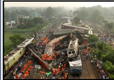
Headline 1: Indian Crash Site (Independent 2023)