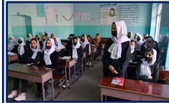
Headline 1: Afghan Schoolgirls (Evening Standard 2023)

Approximately 80 girls at two neighbouring primary schools in Sar-e-Pol province, North Afghanistan are believed to have been poisoned in their classrooms, say local police. The girls, aged up to 12 (the age limit for female school attendance in Afghanistan set by the Taliban) are recovering after at least 60 were taken to hospital as a precaution. No details regarding the type or source of the poison have been released, although poison attacks on schools in the country were not uncommon prior to the Taliban takeover in 2021. Authorities have suggested a third party was paid to release the substance, whilst an education official reported the suspect had a 'personal grudge' but did not elaborate. The news comes months after it was reported approximately 13,000 schoolgirls in Iran have been poisoned in classrooms since November 2022.