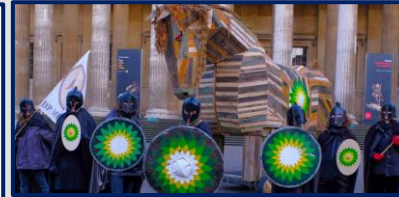
Headline 3: Anti-BP Protests at British Museum (Guardian 2023)

"massive victory for all the artists, activists and workers that campaigned for BP's logo to be taken down from the museum's blockbuster exhibitions, with it now joining the RSC, Royal Opera House and National Portrait Gallery in not renewing sponsorship deals with BP that began back in 2016."