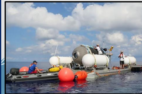
Headline 1: Missing Vessel (Independent 2023)