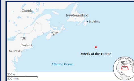
Headline 1: Search Site (Guardian 2023)

Central Middlesex Hospital in North London went into lockdown yesterday afternoon as reports of a disgruntled employee on a stabbing rampage started to emerge. Witnesses saw a man attack and chase employees with a pickaxe at around 13:00 before it is believed he turned the pickaxe on himself prior to his arrest by armed police. The unnamed suspect is currently receiving treatment in hospital for life-threatening injuries, one of his victims is in a critical condition and the other was treated for less serious injuries. Eyewitnesses suggest the three men knew each other and were neighbours embroiled in a dispute. A spokesperson for Scotland Yard confirmed yesterday the incident was not terror related and shot down rumours of a second suspect at large. The hospital went into lockdown for approximately 45 minutes and re-opened with heightened police presence. Scotland Yard confirmed the investigation into the circumstances was ongoing.