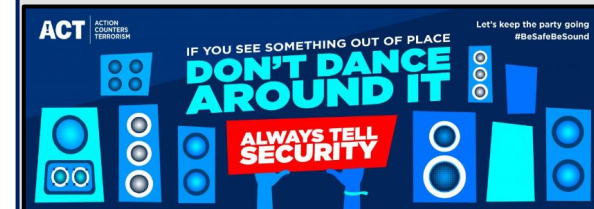
Headline 1: #BeSafeBeSound Initiative (Counter Terror Policing 2023)

The terror trial for four of the five far-right suspects accused of planning attacks on Jewish institutions, mosques and a rap concert at the previously attacked Bataclan music venue in Paris, commenced in a juvenile court in Paris last week due to the age of the defendants when they planned the attacks. The group of five, described by the prosecution as 'steeped in neo—nazi ideology' and members of an online far-right forum Projet WaffenKraft, were 23, 22, 20, 17 and 14 years old when they began plotting attacks in 2017, before an arrest in September 2018 uncovered the extent of the group's efforts. The group was discovered when ringleader, Alexandre Gilet, 22-years-old at the time and a volunteer deputy gendarme, attempted to purchase explosive precursors online. A search of his address revealed bomb making equipment, weapons and ammunition and video footage and photos of group and individual training in weaponry and explosives. Online, officers discovered a search history of possible targets and a far-right manifesto for terror acts. The remaining suspect, who was 14 at the time, was tried last year reports Radio France Internationale (RFI) and given a two-year suspended sentence. This trial is expected to last until Friday. Le Parisien reports nine far-right attacks have been 'foiled' in France since 2017.