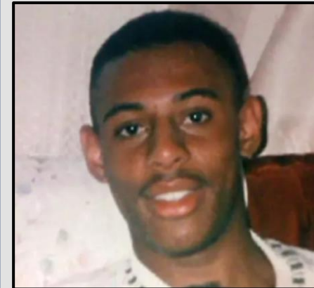
Headline 1: Murdered Stephen Lawrence (My London 2023)

A week after the Greek incident, tragedy struck again this time involving the capsizing of a boat off the coast of the Canary Islands where 35 people are believed to have drowned after setting sail in a boat carrying 59 people. 24 people onboard the vessel were rescued from the waters. Another migrant boat in the same area also experienced difficulty, 51 people on board were rescued.