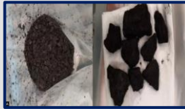
Headline 3: Cocaine Disguised as Coal (BBC News 2023)

Border force officers searching a container (arriving from Columbia) at the London Gateway Port discovered a method of smuggling (seen for the first time in the UK) where 1.6 tonnes of cocaine was disguised as 800 sacks of charcoal and would require laboratory conditions to retrieve the narcotic from the substance. Two addresses searched in Coalville, Leicester are believed to be related to the investigation, a 51-year-old and 31-year-old were arrested on suspicion of importing class A drugs.