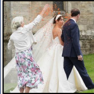
Headline 2: Mr and Mrs Osbourne Covered in Confetti