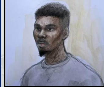
Headline 3: Mohammed Abbkr (BBC News 2023)

The podcast channel had 1,000 subscribers and 152,000 views.