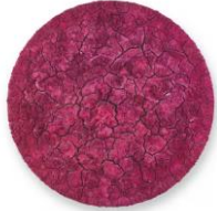
Headline 2: Bosco's Untitled in Red 2011 (Guardian 2023)

The SIA licence over 420,000 officers in the UK and to mark the day they have launched #BehindTheBadge a chance to meet the person behind the officer, read their stories or share your own. For more information on #BehindTheBadge please click here .