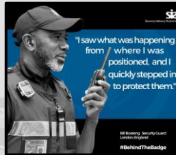
Headline 3: SIA #BehindTheBadge (SIA.com 2023)